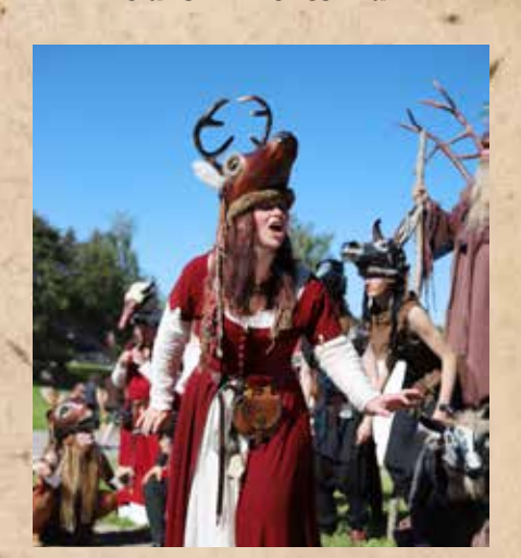
There may be changes in the program without notice